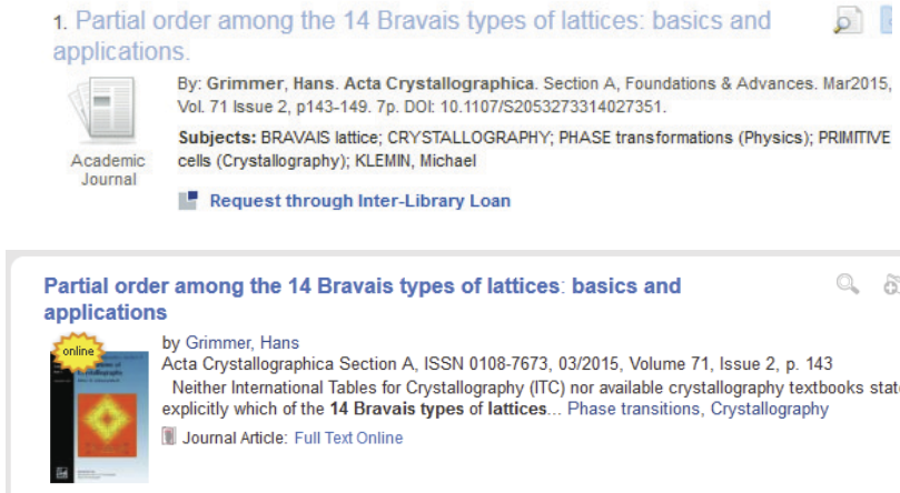
Figure 5. EBSCOhost and Summon discovery services showing the OA article erroneously hidden behind subscription walls.

The scenario illustrated by the previous case study is not acceptable. The fact that OA identification is still done at the journal level across the supply chain needs to change. OA articles will continue to be erroneously labelled as non-OA on the electronic services used by the end-user if at least one of the components of the supply chain fails to embed the publication's OA status in the metadata shared across this chain. OA identification at the article level requires cooperation between all parties involved and the use of common and standard metadata elements. This lack of cooperation and interest is one of the underlying causes of why this problem is still unresolved. Furthermore, if the solution passes for embedding OA information in the metadata, it cannot be a responsibility of the publishers or publishing platforms only. We believe that, as long as discovery services don't use metadata with OA elements at the article level, any effort made by the publishers will fail.