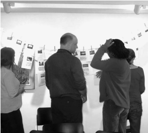
Fig. 1. Workshop participants discuss the 'washing line'.

Marine Energy Parks and work is now underway to prepare sites for 1.6 GW of commercial development. In addition Marine Spatial Planning (MSP) processes are being developed in parallel with the technologies that they will ultimately regulate. Orkney, together with many maritime communities around the world, is now looking to the future in an attempt to understand the social, economic and environmental change that will accompany this new industry.