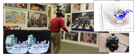
Figure 1: Illustration of the main components of the proposed immersive system.

6-DOF pose of the trainee's head is estimated using visual information acquired by a monocular camera and inertial data provided by an high rate (1 kHz) Inertial Measurement Unit (IMU) integral with a stereoscopic HMD (Fig. 1). The main contribution consists in a novel localization pipeline conceived to cope with fast changes in motion patterns and limit drift and jitter effects, so to minimize system outage and provide consistent user experience.