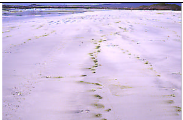
Isabela, algae on the beach of Villamil, southern coast