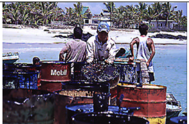
Isabela, drums of IFO recovered at sea