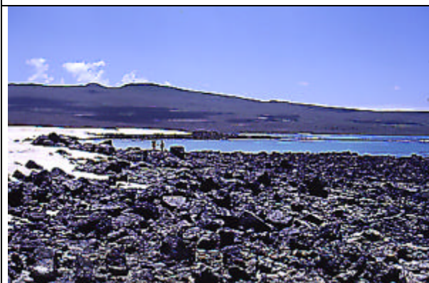
Sheltered bay on San Cristobal northern coast