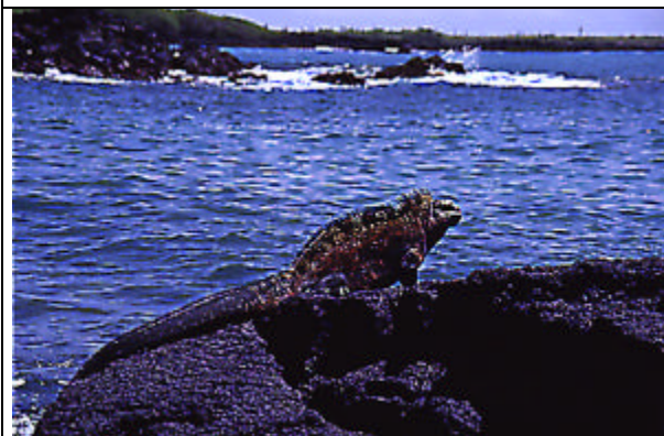
Iguana on southern coast, Isabela