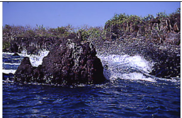
The exposed rocky shore, northern coast San Cristobal