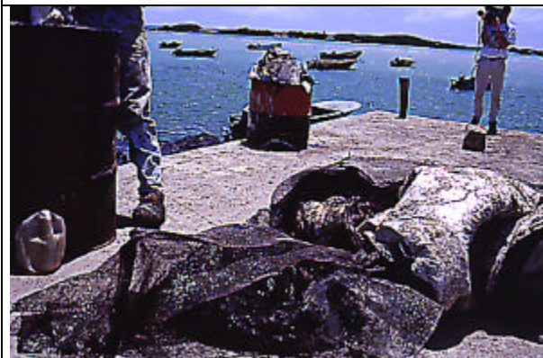
Isabela, self-made booms used to contain the slicks