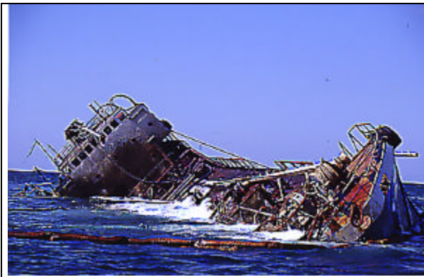
Tanker "Jessica" grounded on San Cristobal island