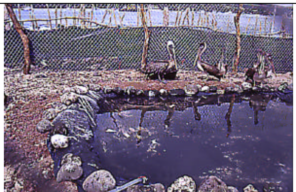
Oiled pelicans in the rescue center, San Cristobal