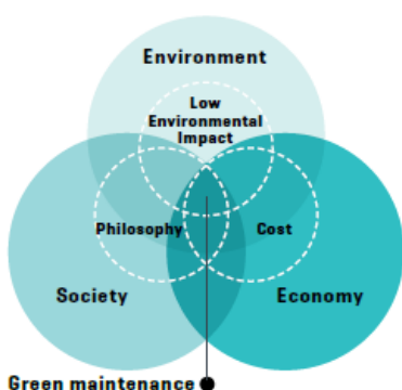
Figure 1 Maintenance parameters

To evaluate the long-term maintenance requirements of historic buildings in relation to the tripartite approach proposed for 'green' maintenance (see Figure 1 ), it is necessary to understand the cumulative effect of routine operations in cost, philosophy, and environmental impact. The proposed evaluation framework has the potential to allow selection of the most sustainable solution.