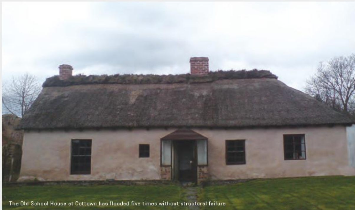
The Old School House at Cottown has flooded five times without structural failure

Cob construction relies on a suitable base made of rubble stone work built in lime mortar, on which are placed suitably prepared earth materials. Balancing the amount of clays and aggregates is essential for most types of earth building, and the clay component can vary from 10% to 40%. Additionally, straw is an essential component, increasing the tensile strength and reducing cracking. The cob material is generally lifted in place using a pitch fork, and built up in non-shuttered (unconfined) working lifts 500mm in height. Compaction is achieved by the operative's feet pressing the wall head then the use of a wooden plank dropped onto the surface, creating a level plane for the next lift. The sides are then 'pared', cut to a relatively perpendicular plane, before final consolidation using a 'mud hammer'.