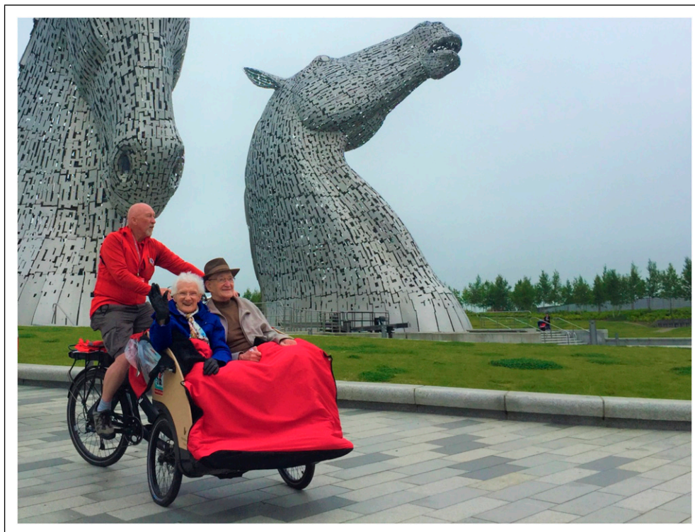
Figure 1. Cycling Without Age trishaws are piloted by a trained volunteer (referred to as a pilot and seated at the rear) with up to two passengers seated up front. Photo credit: A. Gow. Image cannot be reproduced without permission.

CWA within the context of interview-based or pre-/post-test designs. These designs cannot examine the impact of the activity as it happens and limits participation to people capable of answering interview or survey questions. A more inclusive and wide-ranging approach that allows for the measurement of participants' experiences in real-time would therefore provide a complementary addition to CWA evaluations.