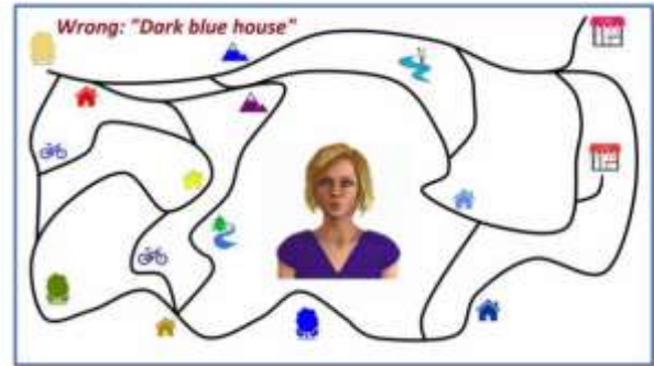
Figure 2: The speaker guides both a human and a virtual human.

A human speaker guides a listener through the map to locate a landmark. Each speaker guides both a human listener and a virtual human listener (Figure 1 and Figure 2, respectively). The listener may indicate that the target has been successfully located by looking at it (correct condition) or that an incorrect target was chosen (wrong condition). It can be seen in Figure 2 that the listener has not found the correct target, the dark blue house, but is instead looking at the other side of the map. Furthermore, the speaker may have insufficient information to uniquely identify a target, resulting in them having to choose between multiple possible choices to guide the listener towards. In Figure 1, for example, the target landmark given to the speaker may be ‘House’, but there is more than one house on the map, leading to an ambiguous situation where the speaker has to decide which house to guide the listener to. These manipulations deliberately generate situations of uncertainty or ambiguity. The speaker believes that the virtual human listener is either controlled by a human (avatar condition) or by a computer “AI” (agent condition). In all conditions, the listener is actually a video, and is non-interactive, although results from the study suggest that this was not identified by the participants, and that they treated the listener like an interactive virtual human.