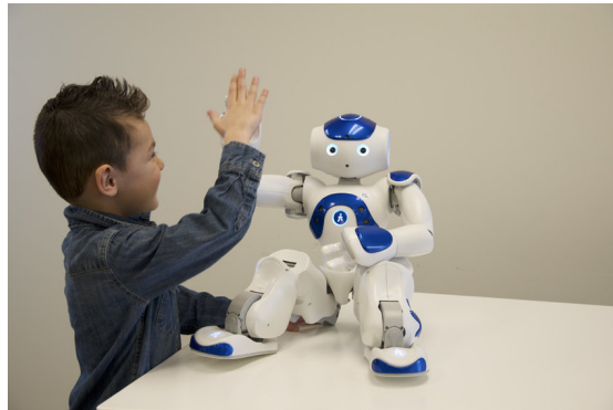
Fig. 1. A child interacting with the Nao robot