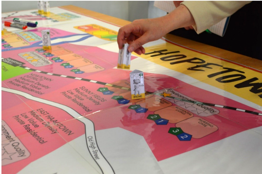
Figure 3. An example of a counter on the board representing a fictional character, Irene.

Each group had a designated facilitator, as well as a note taker drawn from the research team whose task it was to document the process through observational field notes.