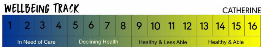
Figure 2. Wellbeing track for people in Hopetown.