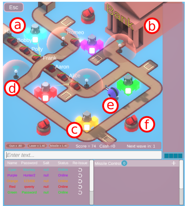
Fig. 1. Screenshot of the game

1) Creeps : The main antagonists of the game, presented as one of either Basic , Hacker , Tank or Interceptor . The primary goal of the game is for the player to use the tools at their disposal to prevent the creeps from getting through the level to their target (the bank).