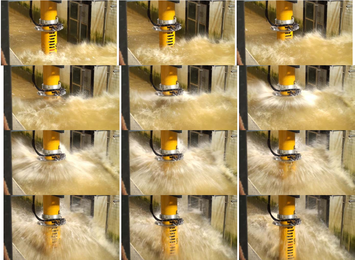
Fig. 4: Pictures ( \Delta t = 0.08 s) of impacting irregular wave on solid platform (porosity 0%) at level +1.75.

Maximum load 2.3 kN for h = 3 m, H_{m0} = 1.0 m and T_p = 5.9 s, all values in model scale.