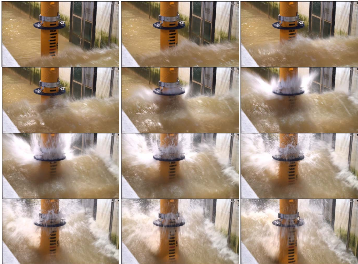
Fig. 3: Pictures ( \Delta t = 0.08 s) of impacting irregular wave on grate platform (porosity 60%) at level +1.75.

Maximum load 1.05 kN for h = 3 m, H_{m0} = 1.0 m and T_p = 5.9 s, all values in model scale.