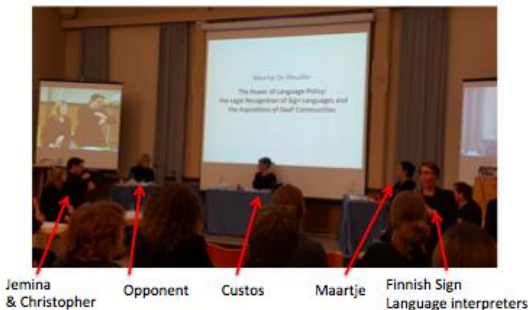
Figure 1: Setting of the PhD defence

disputant then thanks the opponent and asks the audience if anyone has additional questions or comments. In this case, there were no questions. The custos then declares the defence closed. Maartje's whole defence lasted approximately three hours from start to finish.