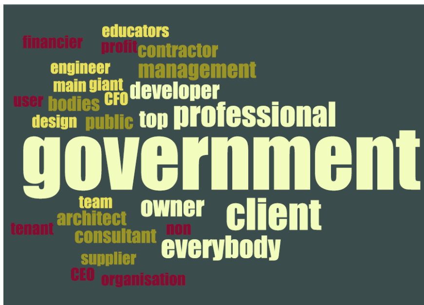
Figure 2. Tag cloud of relative prominence of stakeholders in sustainability practice in the built environment

The result shows that each stakeholder has his/her roles in bringing impacts on sustainability practice, with varying degrees. Although there are disparities in the opinions of stakeholders, the result suggests that the government and project clients play an extremely important role in the pursuit of sustainability practice. Figure 2 is a tag cloud that articulates the relative prominence of stakeholders in leading sustainability practice in the built environment.