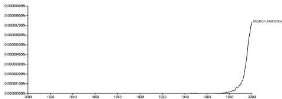
Figure 1 – Google Ngram plot showing how the use of the term Situation Awareness in the English language lexicon has accelerated dramatically since the 1980s

Like so many other Ergonomics concepts, such as workload (Young et al, 2015), trust (Kauer et al, 2015), mental models (Revell and Stanton, 2012), and safety (Hignett et al, 2013) there is no universally accepted definition of situation awareness. There are definitions that are more popular than others, but there are clear differences in how some researchers and practitioners understand and define the concept. Unlike workload, trust and mental models, and as starkly illustrated in recent special issues on SA, the topic is unusual for how hotly debated it is (see Carsten and Vanderhaegen, 2015; Endsley, 2015; Salmon et al, 2015; Stanton, 2010, 2016;