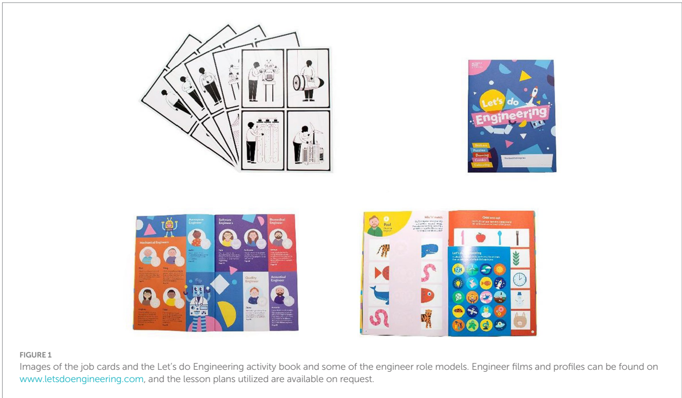
FIGURE 1 Images of the job cards and the Let's do Engineering activity book and some of the engineer role models. Engineer films and profiles can be found on www.letsdoengineering.com , and the lesson plans utilized are available on request.